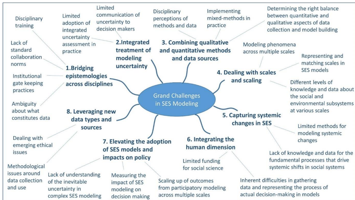
Figure 1: The grand challenges for SES modeling and their underpinning issues